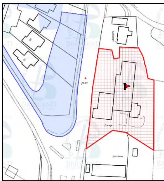
Tree Preservation Order

Ogwr Borough Council's Tree Preservation Order No 18 (1992) covers land on the western side of the A4063 carriageway, identified in blue below: